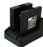
2-bay Battery Charger